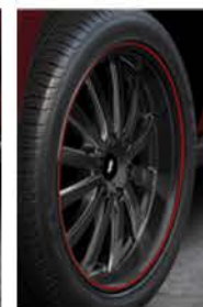
BLACK SATIN-FINISH W/OPTIONAL RED-LINE STRIPE