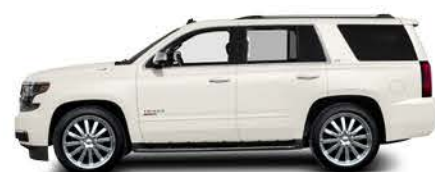
Lowered Ride Height with Specialty Vehicle Engineering Optional Sport Suspension Package