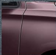
SATIN-FINISH OVER BLACK CURRANT METALLIC