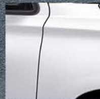
SATIN-FINISH OVER SUMMIT WHITE