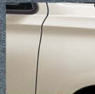
SATIN-FINISH OVER CHAMPAGNE SILVER METALLIC