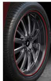
CHARCOAL SATIN-FINISH W/OPTIONAL RED-LINE STRIPE