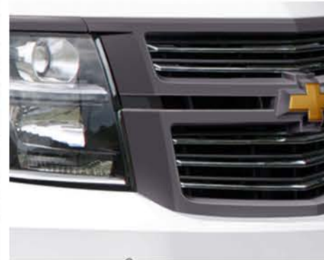
CHROME TRIM PAINT TREATMENT IN CHARCOAL SATIN-FINISH