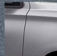
SATIN-FINISH OVER SILVER ICE METALLIC