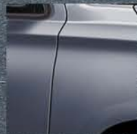
SATIN-FINISH OVER TUNGSTEN METALLIC