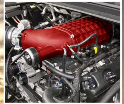
Specialty Vehicle Engineering's High/Output Series supercharged LT-1 engine with 800 horsepower and 750 lb.-ft of torque makes this 2018 Tahoe/Suburban one of the fastest SUVs on the road.

Neck-snapping performance not for the faint-at heart.