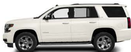
Stock Ride Height

With the addition of our optional Sport Suspension Package, your Tahoe or Suburban stays firmly planted on the road. By lowering it 2" in front and 3" in the rear with our progressive rate springs, this package provides improved handling and gives the vehicle a more aggressive stance.