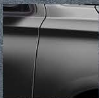
SATIN-FINISH OVER BLACK