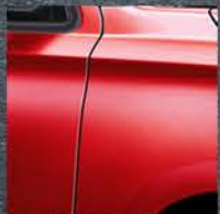
SATIN-FINISH OVER SIREN RED TINTCOAT