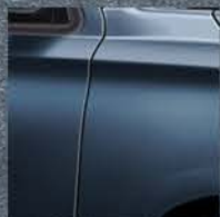
SATIN-FINISH OVER BLUE VELVET METALLIC