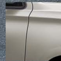
SATIN-FINISH OVER PEPPERDUST METALLIC