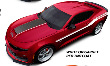
WHITE ON GARNET RED TINTCOAT