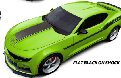
FLAT BLACK ON SHOCK