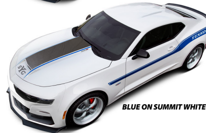
BLUE ON SUMMIT WHITE