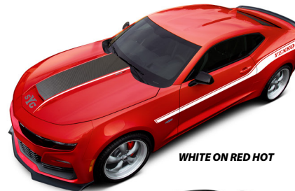
WHITE ON RED HOT