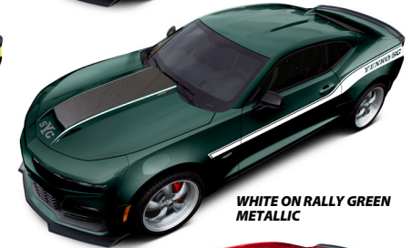
WHITE ON RALLY GREEN METALLIC