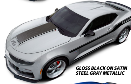
GLOSS BLACK ON SATIN STEEL GRAY METALLIC