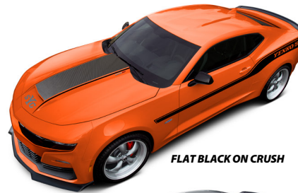
FLAT BLACK ON CRUSH