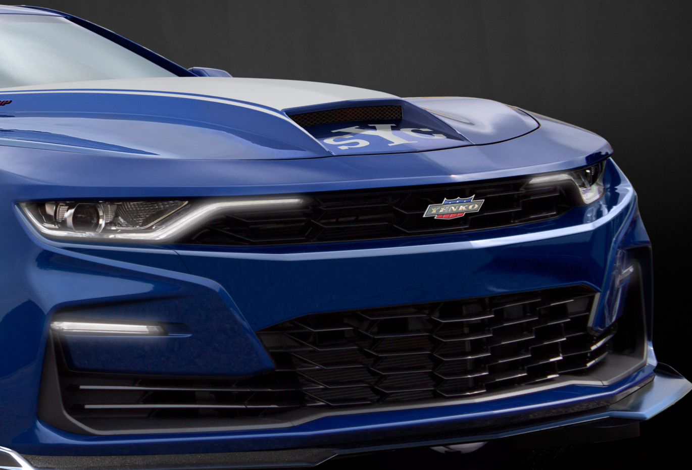
SHOWN WITH OPTIONAL HOOD SCOOP AND SYC® LOGO GRAPHICS TO MATCH STRIPES AND OPTIONAL BLACK SPOKE WHEELS.

heavy-duty cooling system including engine oil cooler, dual outboard radiators, transmission cooler and rear differential cooler. The functional 1LE front splitter helps reduce nose lift and the rear spoiler keeps the rear end firmly planted at speed. The 1LE also features Recaro Performance Seats that keep you planted in position.