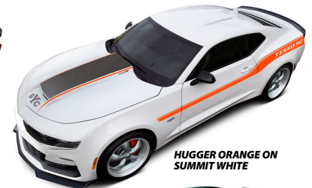
HUGGER ORANGE ON SUMMIT WHITE