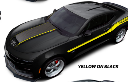
YELLOW ON BLACK