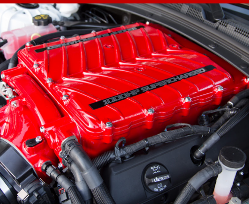
HIGH-OUTPUT SUPERCHARGER WITH 1000HP SUPERCHARGED BADGES. SHOWN WITH OPTIONAL PAINT TREATMENT (BLACK IS STANDARD).

To maximize engine performance, there is no substitute for cubic inches or supercharging. That's why Specialty Vehicle Engineering developed its own supercharged custom-built 416 C.I.D. (6.8L) engine, based on the production 6.2 Liter LT-1 engine, that's included in all of our YENKO® Stage II 1000HP Camaros. This Limited Edition Yenko/SC® is available exclusively through GM dealers throughout the US and Canada.