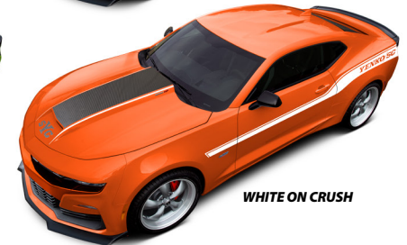
WHITE ON CRUSH