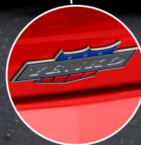
YENKO® CREST EXTERIOR BADGES CALL ATTENTION TO IT'S PERFORMANCE HERITAGE.