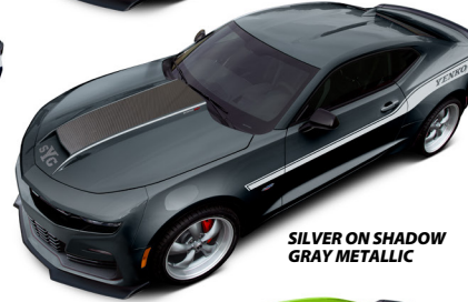
SILVER ON SHADOW GRAY METALLIC