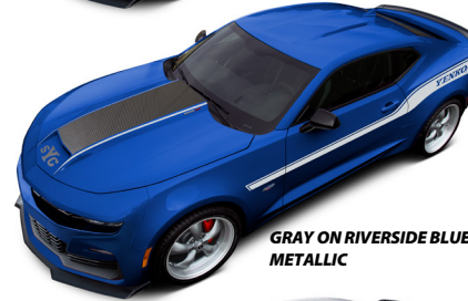
GRAY ON RIVERSIDE BLUE METALLIC