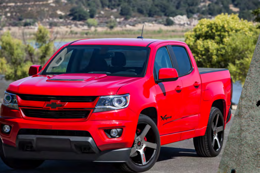
Shown with available gloss black finish with machined face wheels