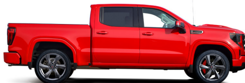
FACTORY RIDE HEIGHT

Brembo 6-piston big front brake calipers in red (custom colors optional) with 16.1" Vented Rotors.