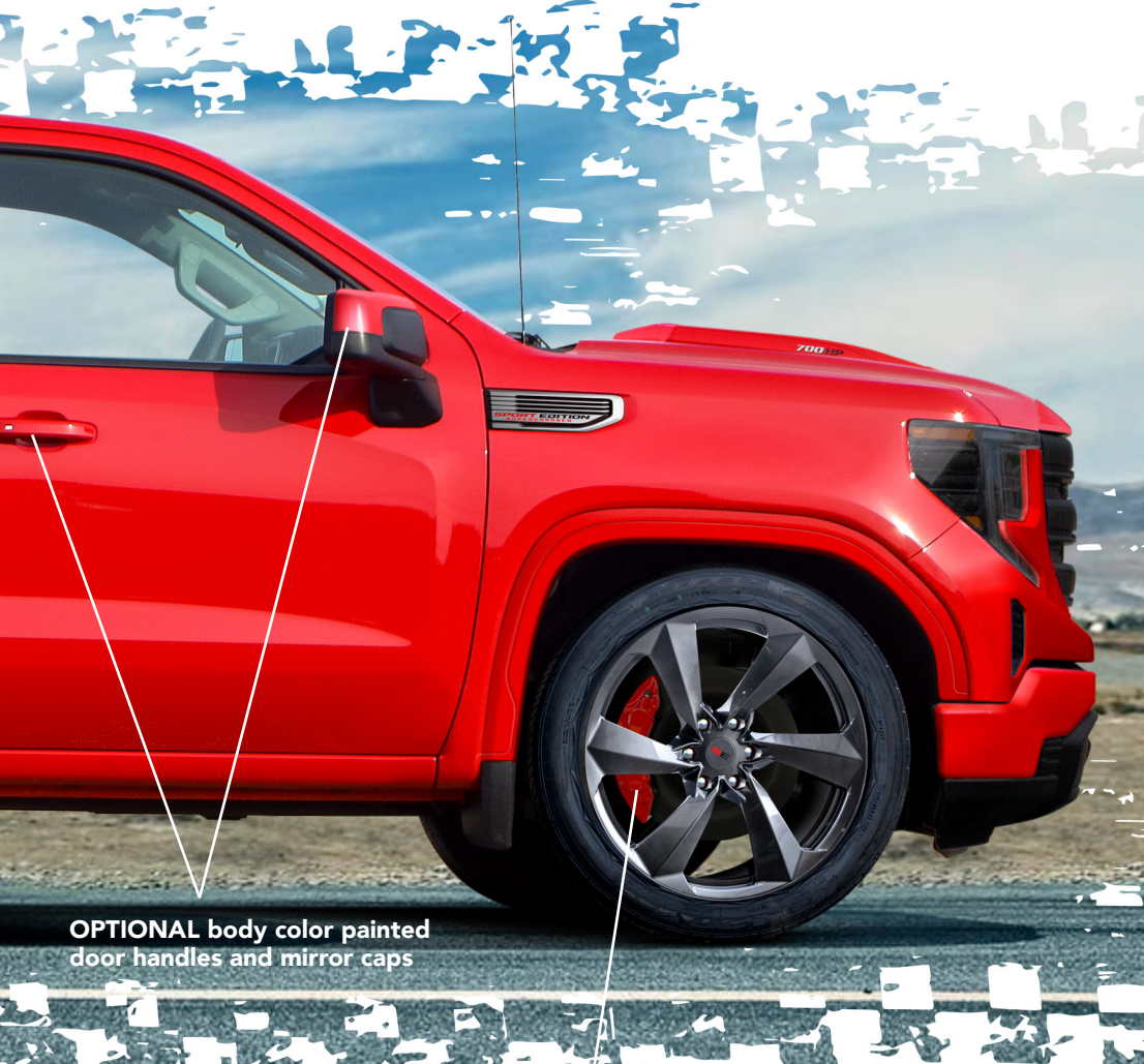
OPTIONAL body color painted door handles and mirror caps