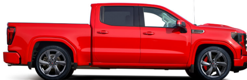
OPTIONAL SPORT SUSPENSION LOWERING KIT