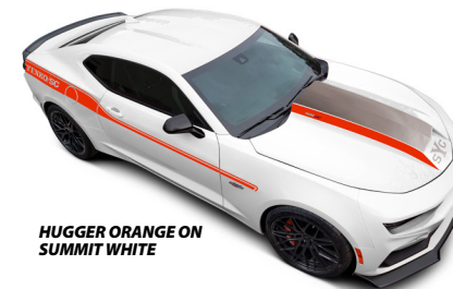
HUGGER ORANGE ON SUMMIT WHITE