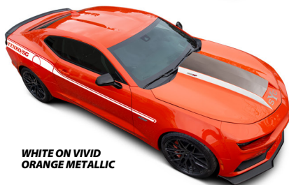
WHITE ON VIVID ORANGE METALLIC