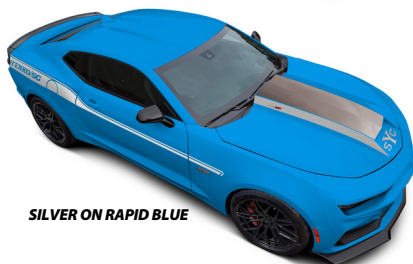
SILVER ON RAPID BLUE