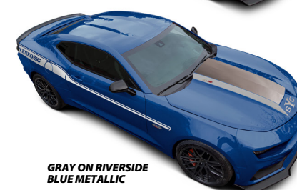
GRAY ON RIVERSIDE BLUE METALLIC