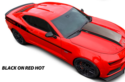
BLACK ON RED HOT