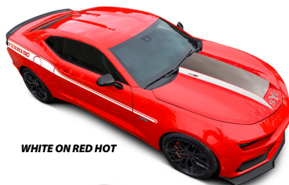
WHITE ON RED HOT

In addition to its awesome horsepower, the 2023 YENKO/SC® Camaros includes many unique interior and exterior features that set it apart from the stock Camaro. Features like the body color painted carbon fiber hood with exposed carbon fiber hood scoop, OE-quality 1100HP or 1150HP badges, YENKO®