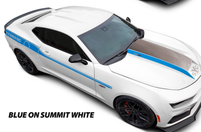
BLUE ON SUMMIT WHITE