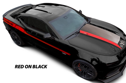
RED ON BLACK