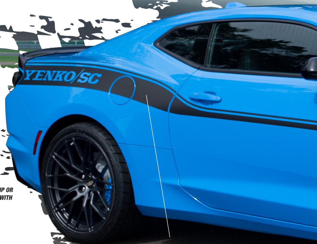
YENKO/SC® side stripe and hood scoop cowl graphics available in 9 colors plus optional high-gloss carbon fiber.

supercharger with a 10-rib dedicated belt drive system utilizing an upgraded fuel system and injectors, a larger throttle body, and custom stainless steel exhaust system.