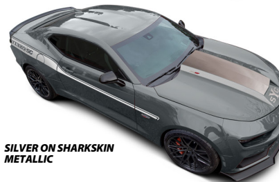
SILVER ON SHARKSKIN METALLIC