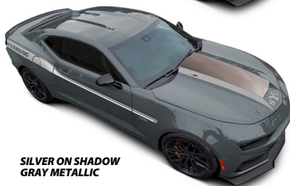
SILVER ON SHADOW GRAY METALLIC