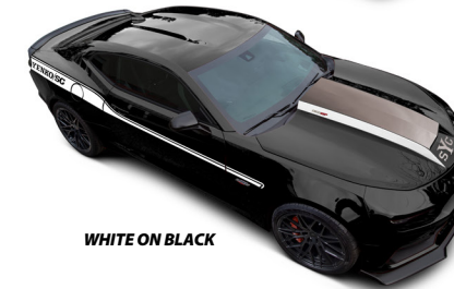
WHITE ON BLACK