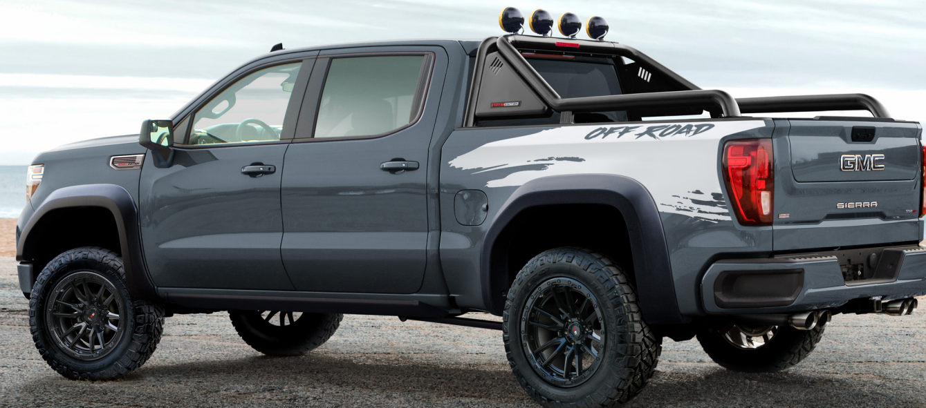
SPORT EDITION SIERRA OFF ROAD SUPERCHARGED