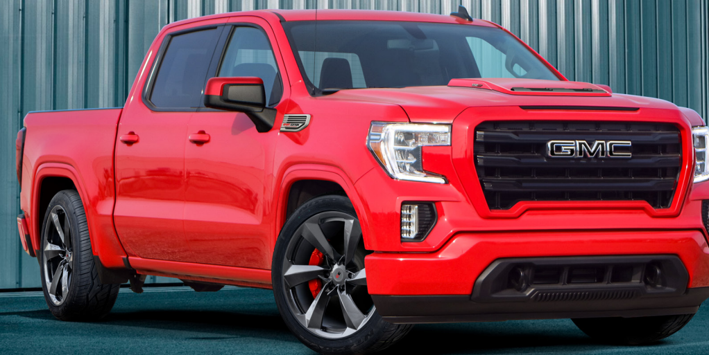
SPORT EDITION SIERRA LOWERED SUPERCHARGED