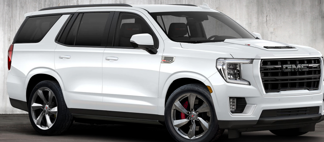
SPORT EDITION YUKON/YUKON XL SUPERCHARGED