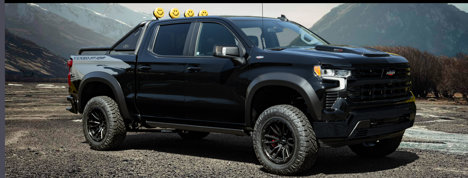
YENKO/SC ® SILVERADO OFF ROAD