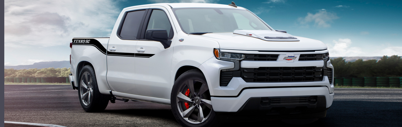
YENKO/SC ® SILVERADO LOWERED