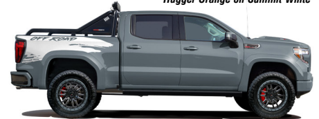
White on Satin Steel Metallic