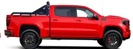
OPTIONAL 4" BDS LIFT