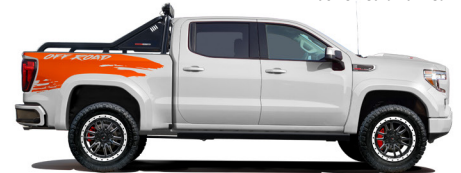
Hugger Orange on Summit White