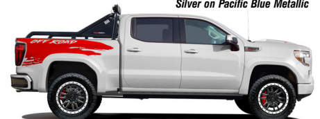
Red on Summit White