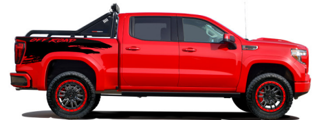
Black on Cardinal Red