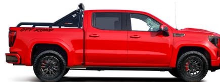
2" FACTORY SUSPENSION LIFT

The 2023 Sierra Off Road is ready to tackle any terrain with OPTIONAL the BDS 4" high clearance lift system with next generation FOX shocks and HD Recoil traction bars designed to put the power to the ground.