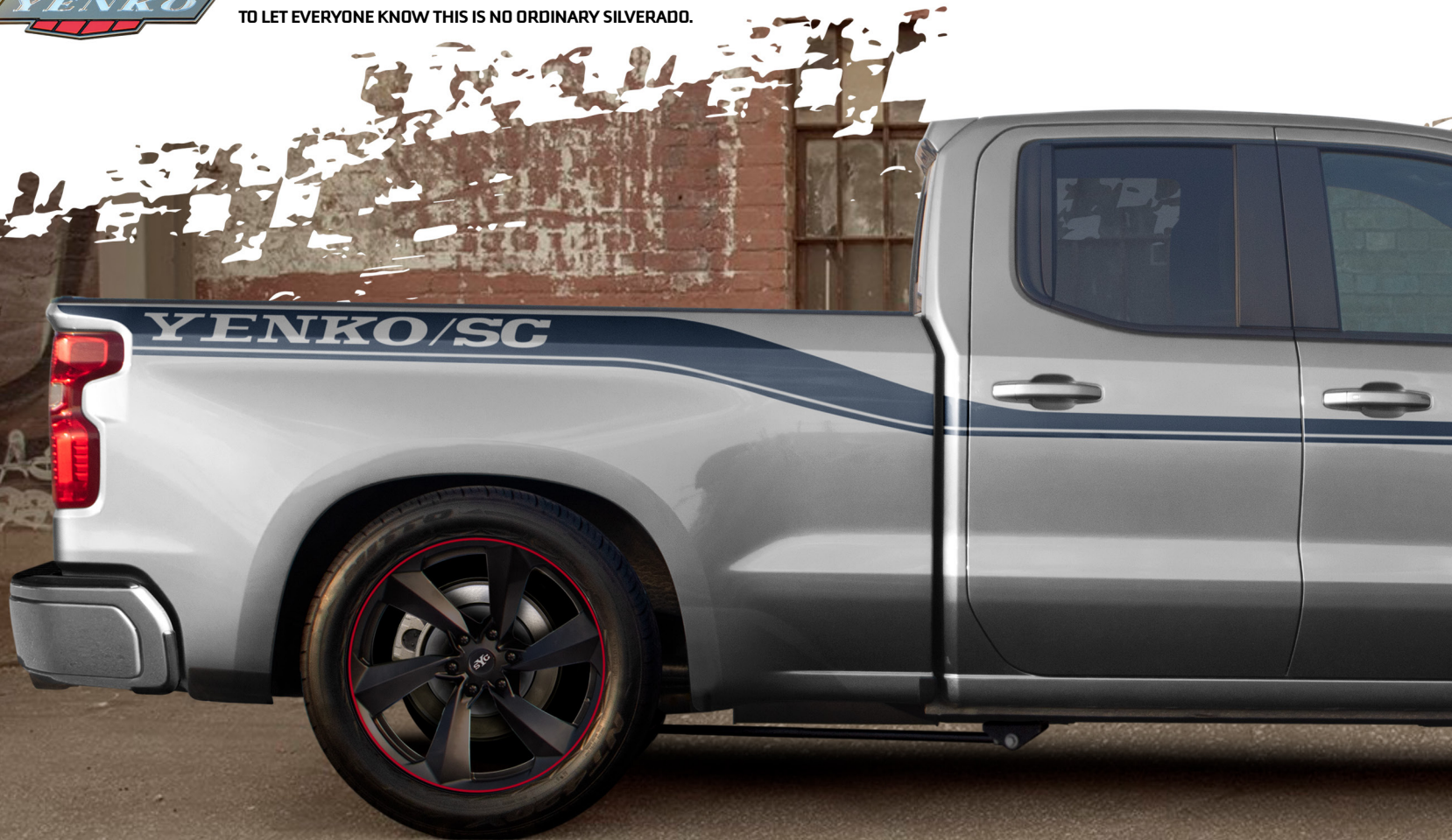
2023 Silverado LT shown with optional sport suspension lowering kit

ICONIC YENKO® CREST EMBLEMS ARE PROUDLY DISPLAYED TO LET EVERYONE KNOW THIS IS NO ORDINARY SILVERADO.