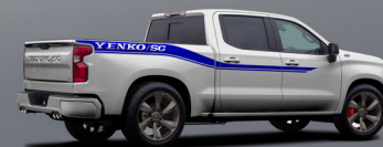
BLUE ON SATIN STEEL METALLIC