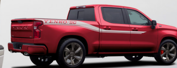
SILVER ON CAJUN RED TINTCOAT