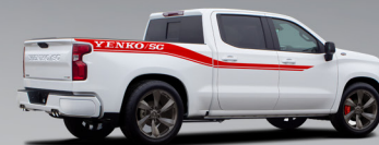
RED ON SUMMIT WHITE