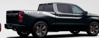
WHITE ON BLACK