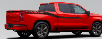
BLACK ON RED HOT