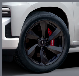
SATIN BLACK W/O RED LINE STRIPE