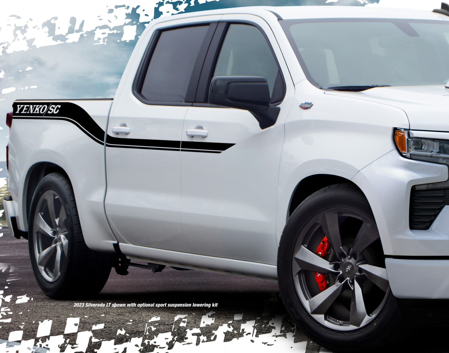
2023 Silverado LT shown with optional sport suspension lowering kit