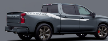
GRAY ON SHADOW GRAY METALLIC