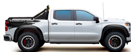
2" FACTORY SUSPENSION LIFT

The OPTIONAL BDS 4" coilover lift system with Fox® front and rear performance shocks. Includes larger diameter Nitto off road performance tires