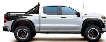
OPTIONAL 4" BDS LIFT