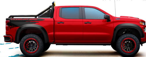
Gloss Black on Red Hot