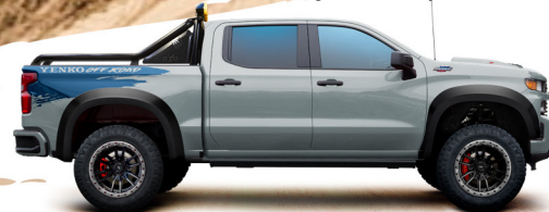
Blue on Satin Steel Metallic