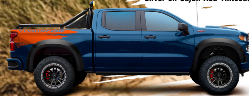
Orange on Northsky Blue Metallic