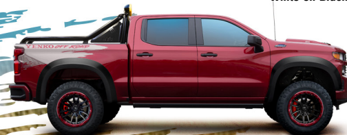
Silver on Cajun Red Tintcoat