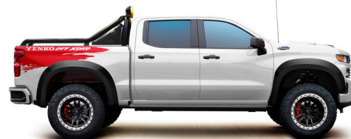
Red on Summit White