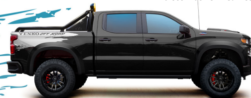
White on Black