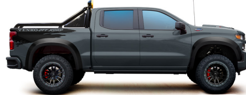
Flat Black on Dark Ash Metallic

Stainless steel cat-back dual exhaust system with dual tips