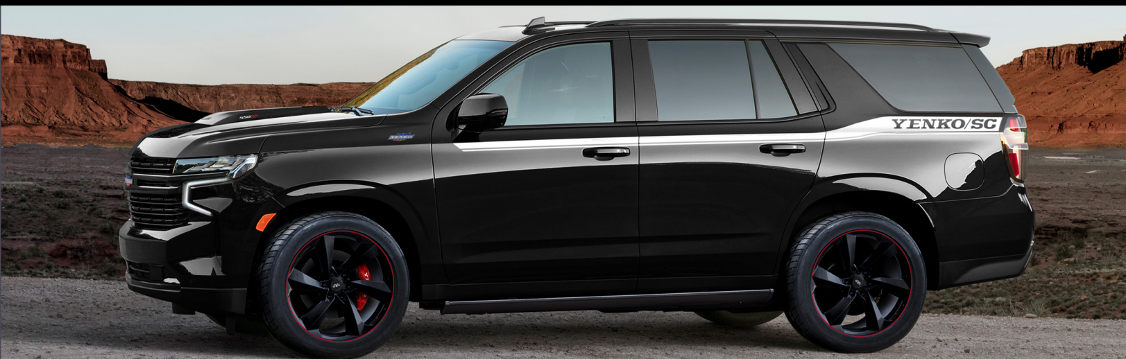
YENKO/SC® TAHOE AND SUBURBAN