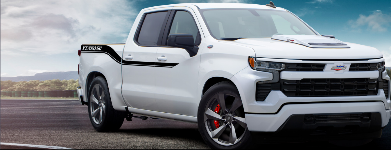
YENKO/SC® SILVERADO LOWERED