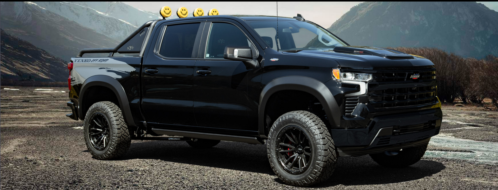
YENKO/SC® SILVERADO OFF ROAD