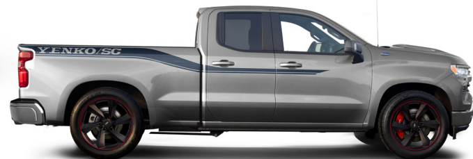
OPTIONAL SPORT SUSPENSION LOWERING KIT