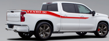
RED ON SUMMIT WHITE