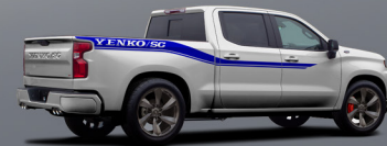
BLUE ON SATIN STEEL METALLIC