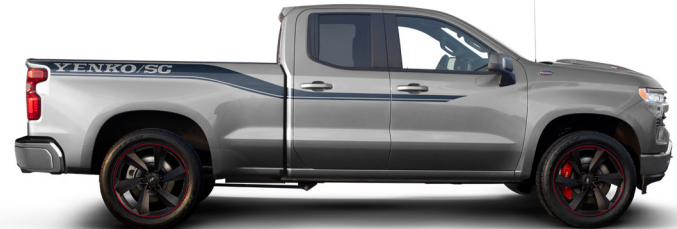
FACTORY RIDE HEIGHT

The OPTIONAL Sport Suspension Lowering Kit lowers the truck 2" in front and 5" in the rear and includes with Fox® front and rear performance shocks for a more more aggressive appearance.