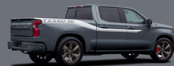
GRAY ON SHADOW GRAY METALLIC