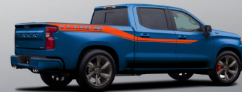
ORANGE ON NORTHSKY BLUE METALLIC