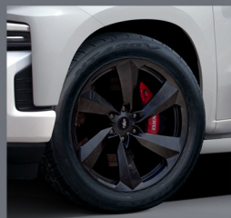
SATIN BLACK W/O RED LINE STRIPE