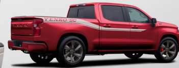
SILVER ON CAJUN RED TINTCOAT