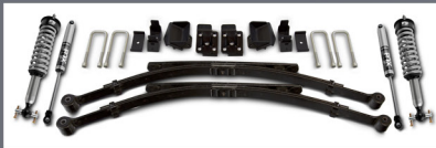
OPTIONAL SPORT SUSPENSION SYSTEM

OPTIONAL HIGH-IMPACT OE-QUALITY COMPOSITE BUMPER STEP DELETES PAINTED IN GLOSS-FINISH BODY COLOR. ONLY AVAILABLE WITH BODY COLOR PAINTED REAR BUMPER.