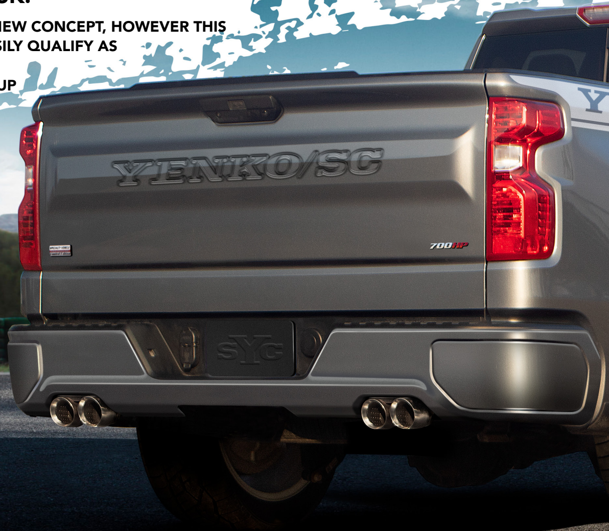
2024 Silverado LT shown with optional sport suspension lowering kit

*NOTE: Only 50 each 2024 700HP and 800HP YENKO® Silverado Lowered pickup trucks will be built.