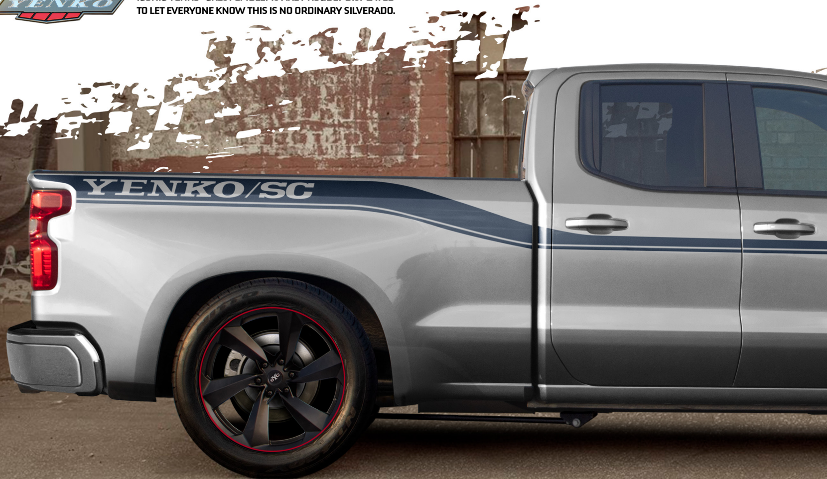
2024 Silverado LT shown with optional sport suspension lowering kit

ICONIC YENKO® CREST EMBLEMS ARE PROUDLY DISPLAYED TO LET EVERYONE KNOW THIS IS NO ORDINARY SILVERADO.