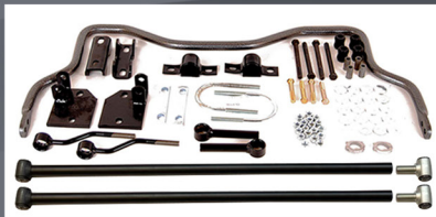
REAR SWAY BAR ASSEMBLY AND HD TRACTION BARS

OPTIONAL BODY COLOR PAINTED FRONT GRILLE BARS ON MODELS WITH FACTORY CHROME INCLUDES OE-QUALITY YENKO® CREST BADGE WITH CUSTOM LANDING PAD IN GLOSS BLACK OR BODY COLOR (W/OPTIONAL PAINTED GRILLE BARS)