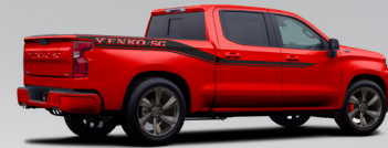
BLACK ON RED HOT