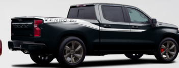
WHITE ON BLACK