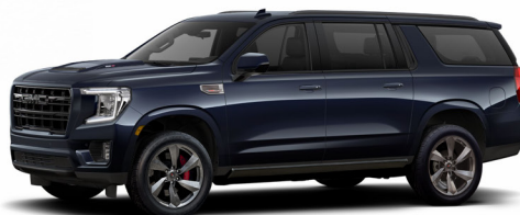
FACTORY RIDE HEIGHT

Brembo 6-piston big front brake calipers in red (custom colors optional) with 16.1" Vented Rotors (GMC dealer supplied)