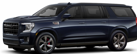
OPTIONAL SPORT SUSPENSION LOWERING KIT