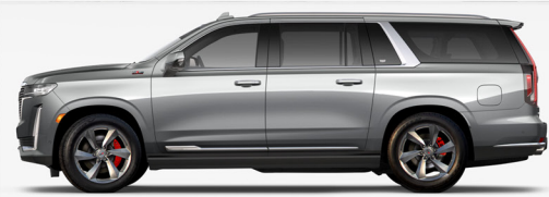
OPTIONAL SPORT SUSPENSION LOWERING KIT