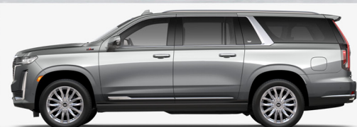
FACTORY RIDE HEIGHT

Brembo 6-piston big front brake calipers in red (custom colors optional) with 16.1" Vented Rotors (Cadillac dealer supplied)