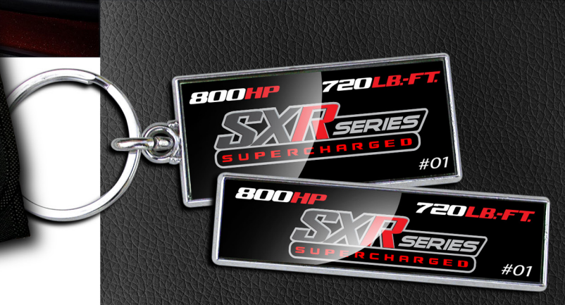
OE-quality SXR Series Supercharged emblems for fenders and liftgate