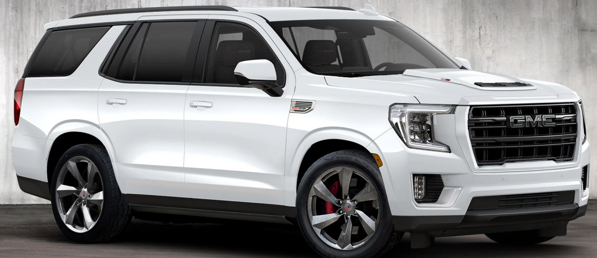
SPORT EDITION YUKON/YUKON XL SUPERCHARGED