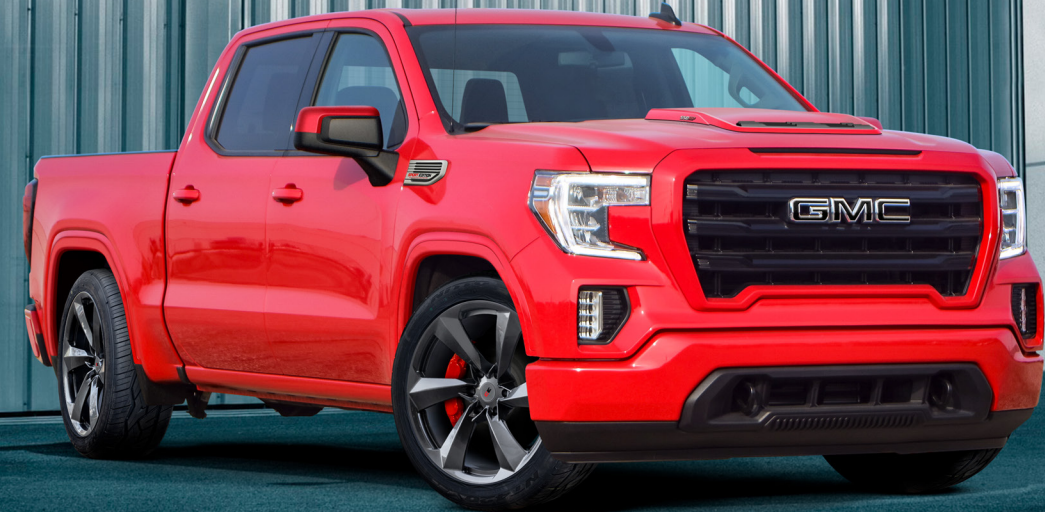
SPORT EDITION SIERRA LOWERED SUPERCHARGED