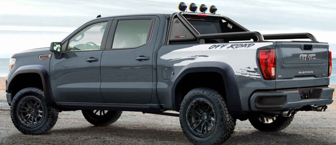
SPORT EDITION SIERRA OFF ROAD SUPERCHARGED