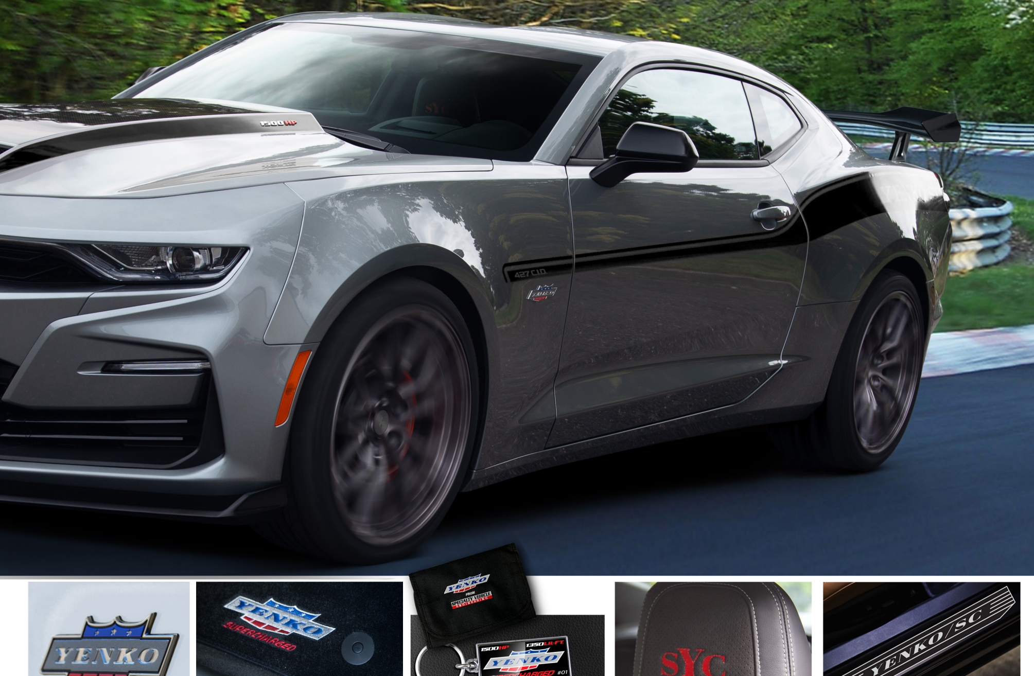
YENKO° Crest badges for front grille, fenders, and rear panel.