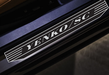
sYc* embroidered front seat headrests. YENKO/SC* doorsill plates.