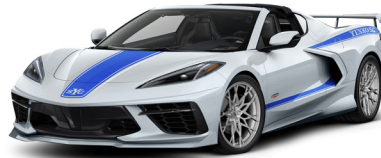
Blue on Silver Flare Metallic