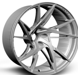
19" x 9.5" Front and 20" x 12" Rear in Polished Finish