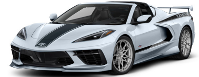
Black on Ceramic Matrix Gray Metallic