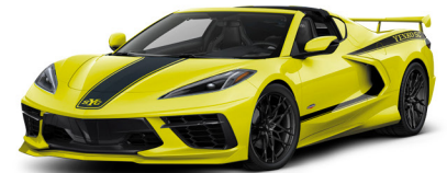
Black on Accelerate Yellow Metallic