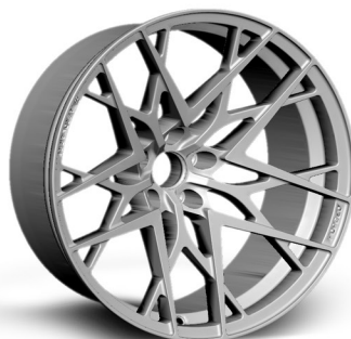
19" x 9.5" Front and 20" x 12" Rear in Polished Finish