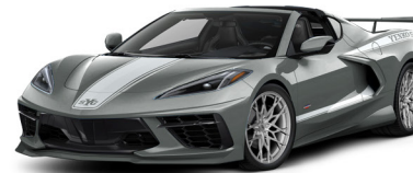
White on Hypersonic Gray Metallic