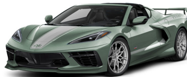
Silver on Cacti Green