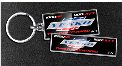
1000HP YENKO/SC numbered (1-10 for 2024, 1-50 for 2025) dash plaque and two numbered keyfobs displaying the HP and torque.

YENKO Crest embroidered portfolio, owner's manual, window sticker.