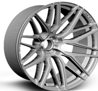
19" x 9.5" Front and 20" x 12" Rear in Polished Finish