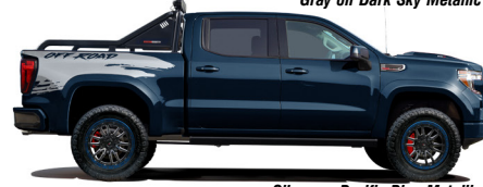
Silver on Pacific Blue Metallic