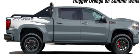
White on Satin Steel Metallic