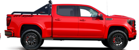
OPTIONAL 4" BDS LIFT