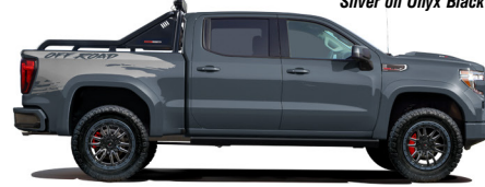
Gray on Dark Sky Metallic