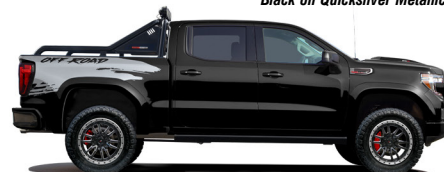
Silver on Onyx Black