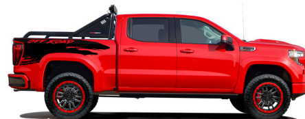
Black on Cardinal Red