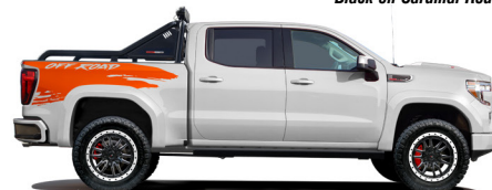
Hugger Orange on Summit White