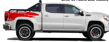
Red on Summit White