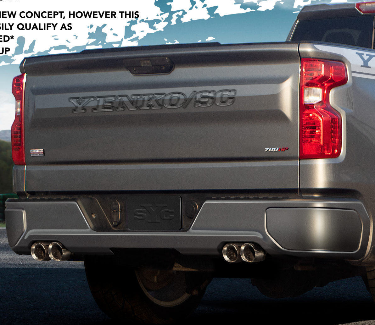
2024 Silverado LT shown with optional sport suspension lowering kit

*NOTE: Only 50 each 2024/25 700HP, 800HP, and 1000HP YENKO® Silverado Lowered pickup trucks will be built.