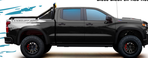
White on Black