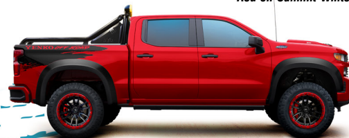
Gloss Black on Red Hot