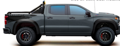
Flat Black on Dark Ash Metallic