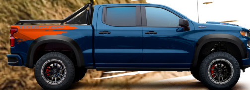
Orange on Northsky Blue Metallic