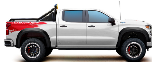
Red on Summit White

Graphics are made from O.E.-quality vinyl that won't fade, crack, or peel.