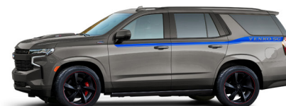
BLUE ON EMPIRE BEIGE METALLIC