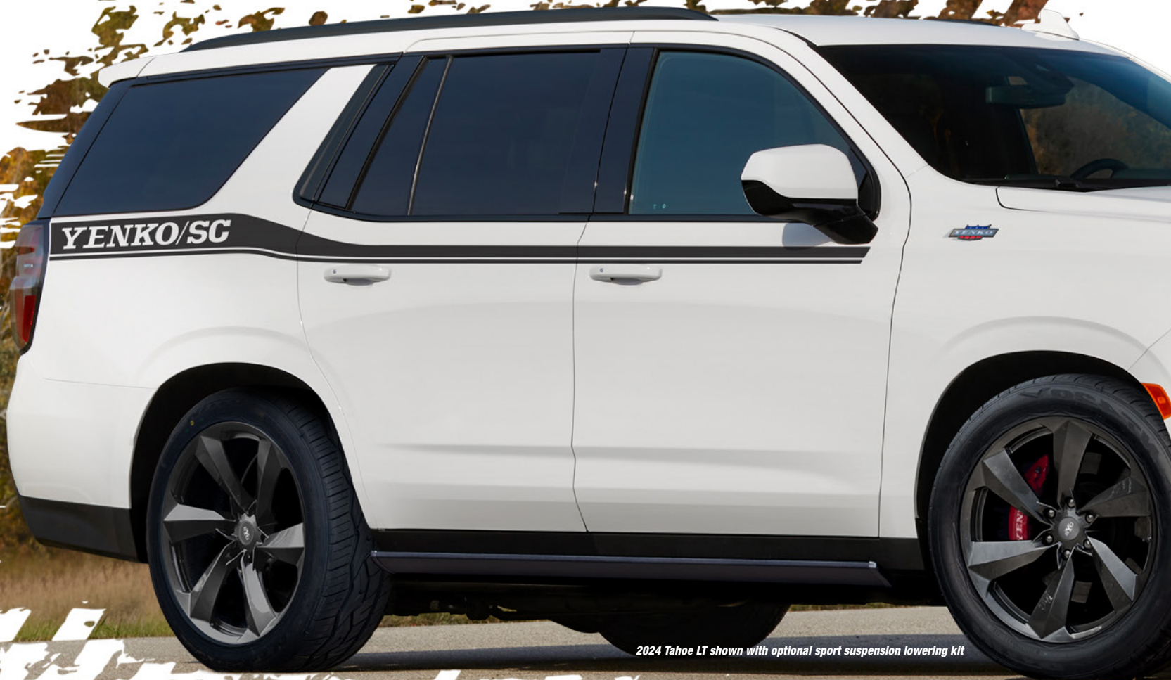
2024 Tahoe LT shown with optional sport suspension lowering kit

SPECIALTY VEHICLE ENGINEERING INTRODUCES THE NEW FOR 2024/25 700HP (5.3L), 800HP (6.2L), AND 1000HP (6.8L) YENKO/SC® TAHOE AND SUBURBAN. AVAILABLE ON 2024/25 2WD OR 4WD LS, LT, RST, Z71, PREMIER, AND HIGH COUNTRY MODELS. AVAILABLE ONLY FROM GM DEALERS NATIONWIDE.