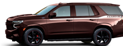
WHITE ON AUBURN METALLIC