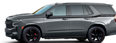
BLACK ON STERLING GRAY METALLIC