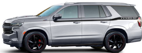
OPTIONAL SPORT SUSPENSION LOWERING KIT