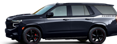
WHITE ON MIDNIGHT BLUE METALLIC