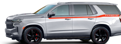
HUGGER ORANGE ON SUMMIT WHITE