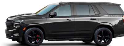
SILVER ON DARK ASH METALLIC