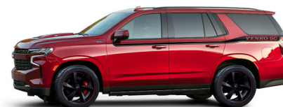
BLACK ON RADIANT RED METALLIC