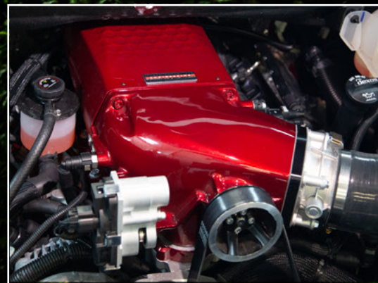
SUPERCHARGER COMES STANDARD IN BLACK. CUSTOM COLORS OPTIONAL. SHOWN IN BODY COLOR PAINT.

NECK-SNAPPING PERFORMANCE NOT FOR THE FAINT-AT-HEART! NOW AVAILABLE WITH 91 OR 93 OCTANE CALIBRATION!