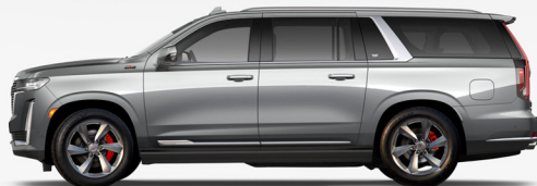
OPTIONAL SPORT SUSPENSION LOWERING KIT