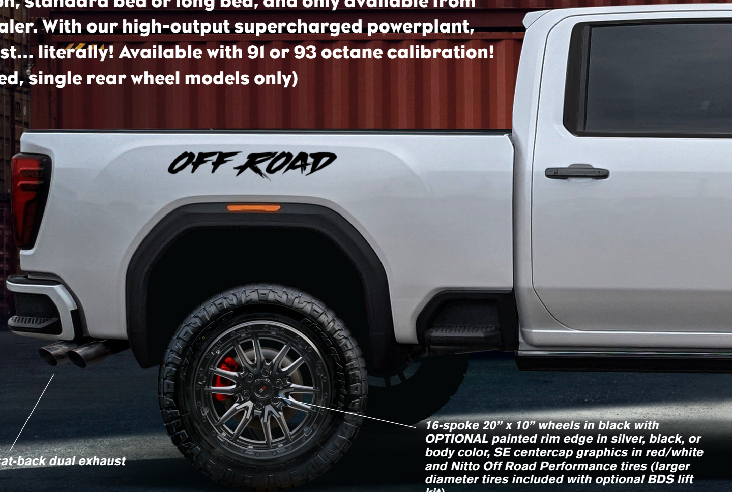
Stainless steel cat-back dual exhaust system

Specialty Vehicle Engineering introduces the new for 2024/25 1000HP SPORT EDITION SUPERCHARGED Sierra 2500/3500 Heavy-Duty Off Road pickup truck. Available on all 2024/25 4WD models of crew cab and double cab trucks with 10-speed transmission, standard bed or long bed, and only available from your GM dealer. With our high-output supercharged powerplant, they'll go fast... literally! Available with 91 or 93 octane calibration! (Gas powered, single rear wheel models only)