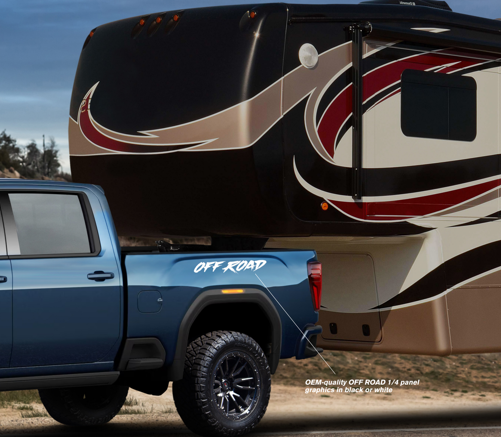
OEM-quality OFF ROAD 1/4 panel graphics in black or white