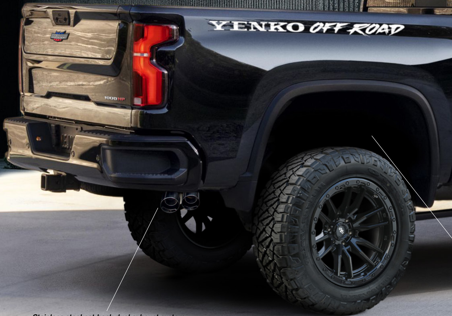
Stainless steel cat-back dual exhaust system