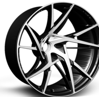
19" x 9.5" Front and 20" x 12" Rear in Black Finish or Black w/Machined Face