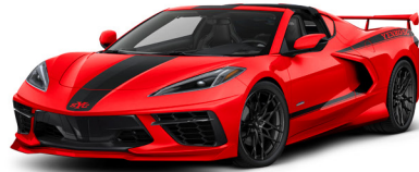
Black on Torch Red