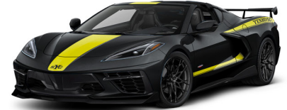
Yellow on Black