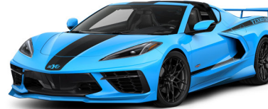
Black on Rapid Blue