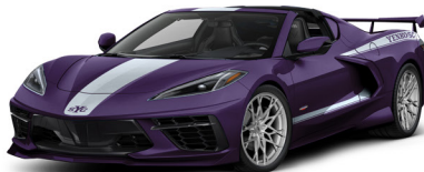
Silver on Hysteria Purple