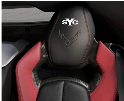
sYc logo embroidered in white on headrests (custom colors optional).

THE 2025 YENKO/SC® TWIN TURBOCHARGED C8'S INTERIOR INCLUDES THE SYC LOGO EMBROIDERED ON THE FRONT HEADRESTS, EMBROIDERED FLOORMATS AND MORE REMINDING YOU THIS IS NO ORDINARY CORVETTE!