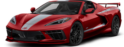
Silver on Red Mist Metallic Tintcoat