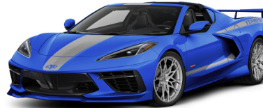
Gray on Riptide Blue Metallic