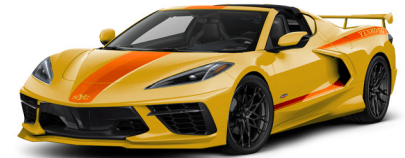
Hugger Orange on Competition Yellow