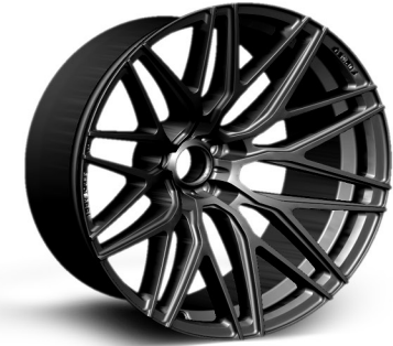
19" x 9.5" Front and 20" x 12" Rear in Black Finish, or Black Finish w/Redline Stripe