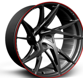
19" x 9.5" Front and 20" x 12" Rear in Black Finish and w/Redline Stripe