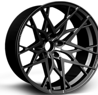
19" x 9.5" Front and 20" x 12" Rear in Black Finish