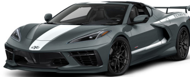
White on Sea Wolf Gray Metallic