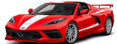
White on Torch Red