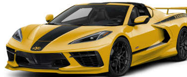
Black on Competition Yellow