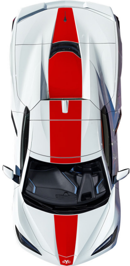
Coupe hood, roof, and decklid graphic configuration