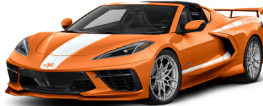
White on Sebring Orange Tintcoat