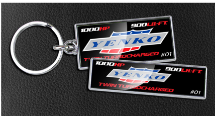
1000HP or 1250HP YENKO/SC numbered (1-50) dash plaque and two numbered keyfobs displaying the HP and torque.

YENKO Crest embroidered portfolio, owner's manual, window sticker.