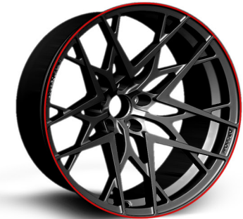
19" x 9.5" Front and 20" x 12" Rear in Black Finish w/Redline Stripe