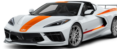
Hugger Orange on Arctic White